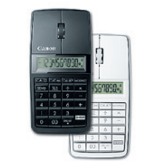
X Mark I Mouse Slim

Canon Information and Imaging Solutions, Inc. brings value to organizations of all industries and sizes. Its solutions and services are organized into the following Practice Areas: Business Process Optimization, Imaging and Records Management, and Security Services. The Services are designed to tightly integrate Canon technology into customers' business applications, thus empowering workers to perform their jobs more effectively.